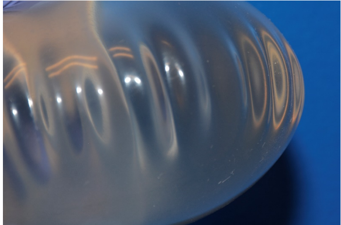
Figure 2 Rippling or Scalloping of a saline implant can be felt through the tissue and sometimes seen.

Saline implants tend to “ripple” much more than their silicone counterparts. In fact, that is where the term “rippling” originates is from the characteristic sloshing or jiggling sensations present with saline implants. Additionally, the rounded edge or sides of the implant tend to fold or crease more frequently and to a greater extent. This creasing is like a slight scalloping of the contour of the implant. Ideal Implant Inc. makes an implant that utilizes baffles inside the device that help restrict the movement