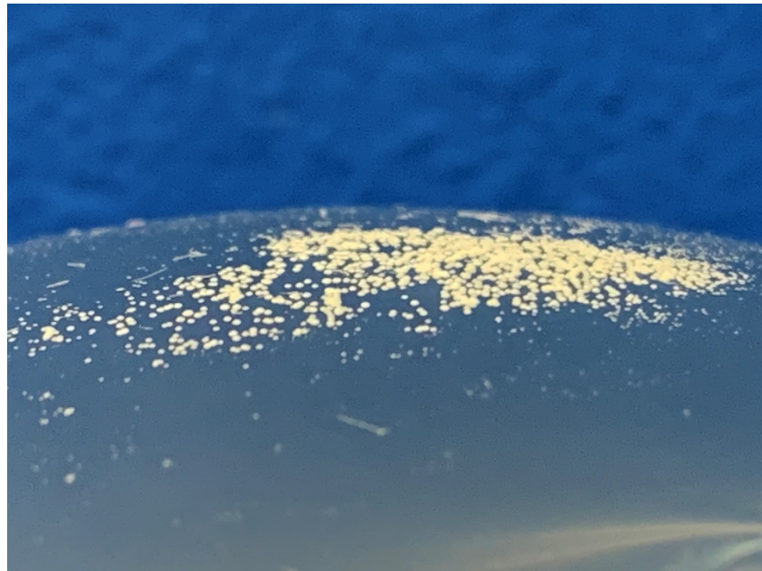
Figure 1 Biological processes can attach to the surface of an implant.

This is a close-up photograph of a saline implant that I removed from a patient showing small calcifications attached firmly to the implant itself. I could not wipe or peel these calcifications off the surface without fear of tearing the implant shell itself. No, this is not biofilm, and the patient didn’t remove the implants because she was having any type of symptoms. Biofilm is invisible to the naked eye. I include this photograph just to help you understand that biological processes can firmly and permanently attach themselves to implants in the