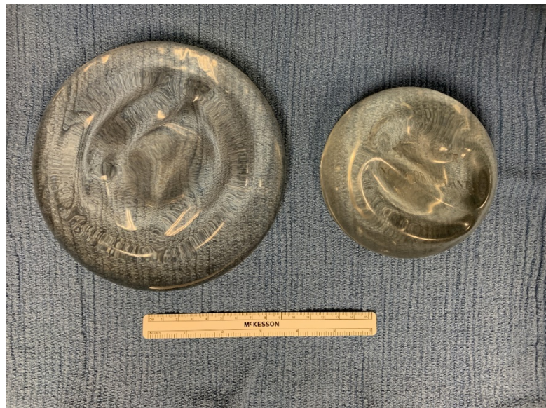
Figure 4 A particularly extreme example of the diameter of an implant I removed from a patient to the maximum size I would allow her to put in.

This photograph compares an implant that I removed from a patient (total volume 650 cc's, base diameter 15.4 cm, projection 4.7 cm) with the largest implant that I would have allowed her to size into (total volume 350, base diameter 10.1 cm, projection 5.2 cm). This is a particularly extreme example of how differently surgeons size implants to patients. I actually used a smaller implant than the maximum I would have allowed. Both the implant I removed and the implant I replaced it with had similar projections (differing by only 0.5 cm) but the implant I removed was a moderate plus projection and the implant I replaced